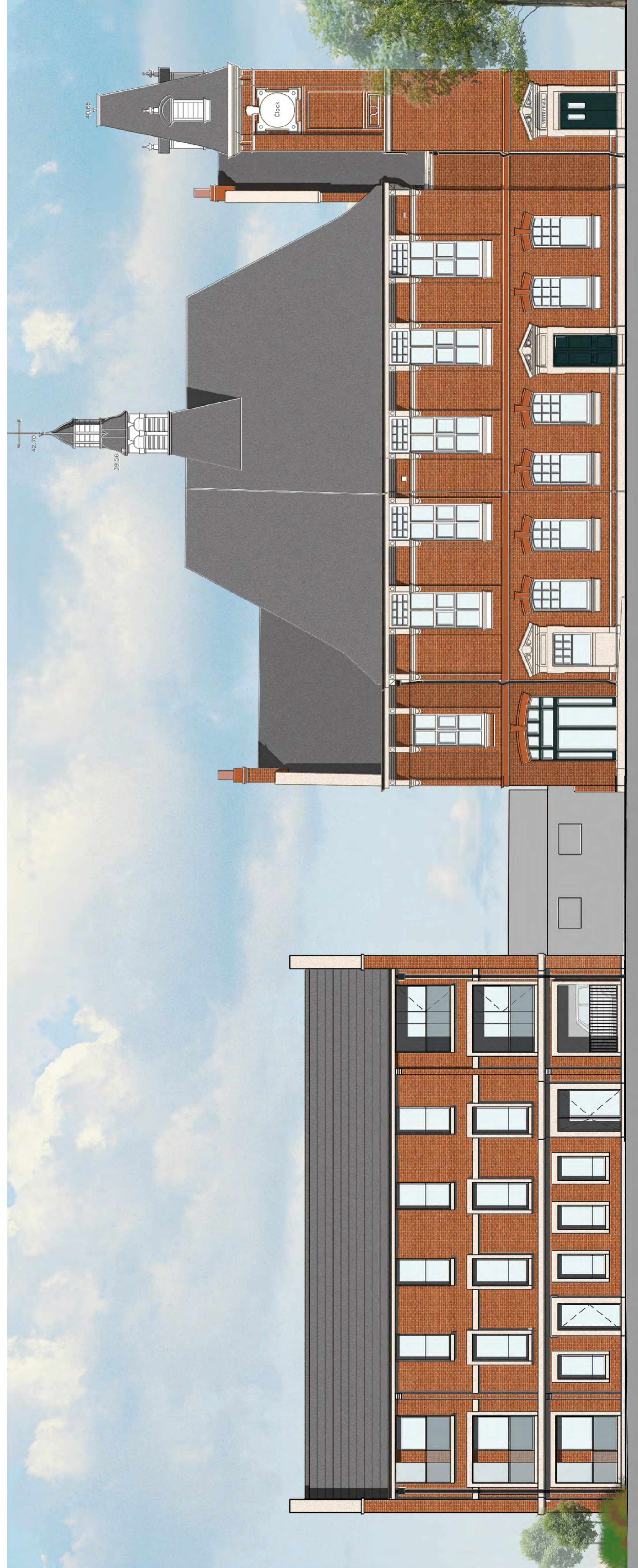
London Road Elevation 1:100

Notes: Do not scale from this drawing. All contractors must visit the site and be responsible for taking and checking dimensions. All construction information should be taken from figured dimensions only. Any discrepancies between drawings, specifications and site conditions must be brought to the attention of the supervising officer. This drawing & and the works depicted are the copyright of John Thompson & Partners. This drawing is for planning purposes only. It is not intended to be used for construction purposes, whilst all reasonable efforts are used to ensure drawings are accurate, John Thompson & Partners accept no responsibility or liability for any reliance placed on, or use made of, this plan by anyone for purposes other than those stated above.