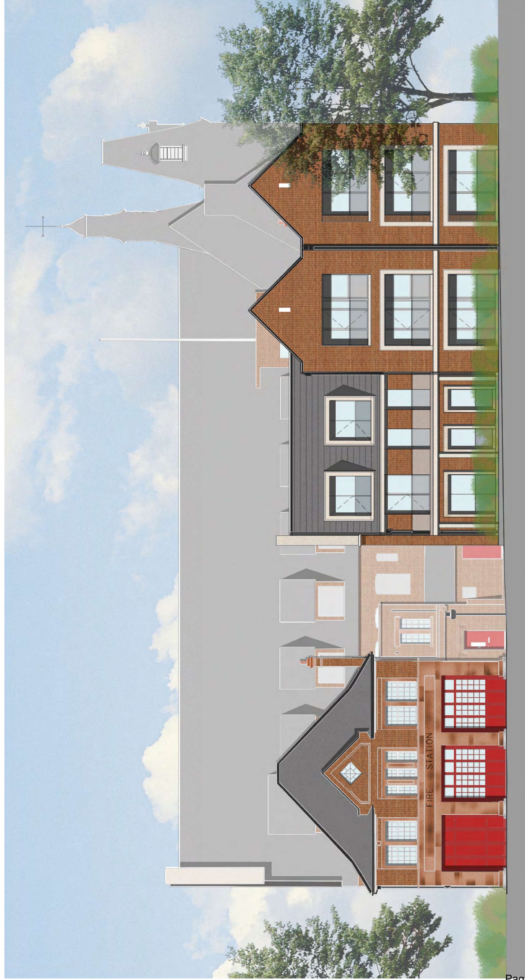
Lower Green West Elevation 1:100